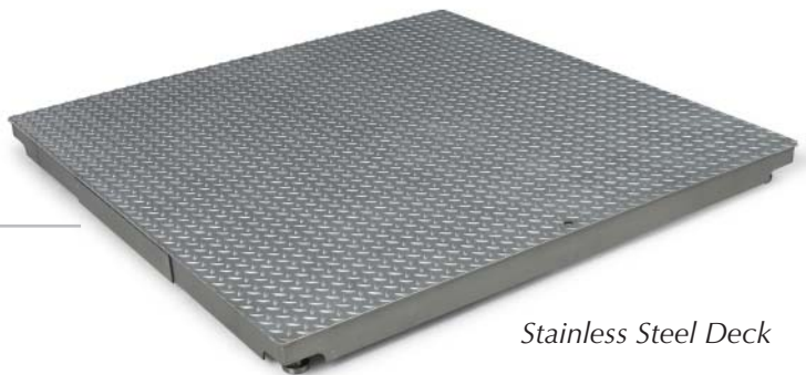
Stainless Steel Deck