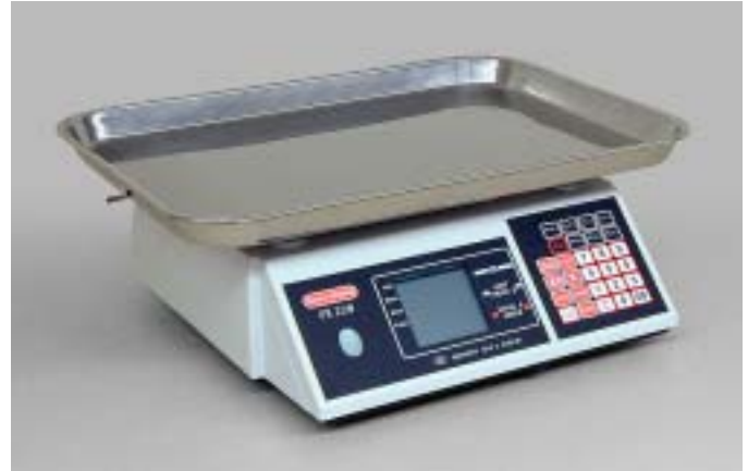
above: optional produce/fish tray left: optional customer tower